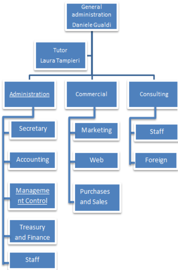
Visual Representation of Departments in "ETIMOS CO"